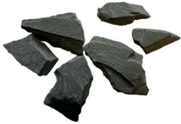
Natural Grey Slate